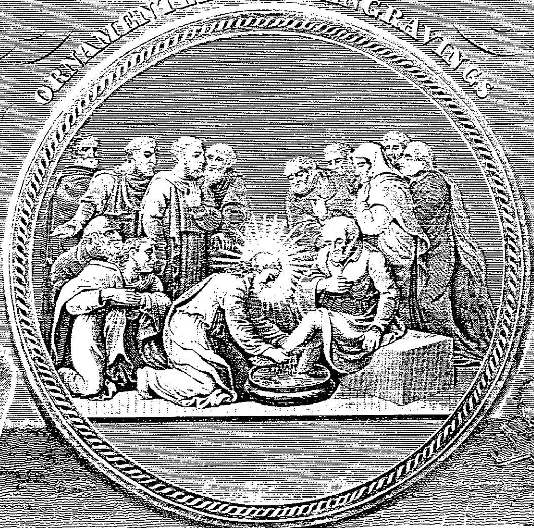
OUR SAVIOUR WASHING THE DISCIPLES FEET